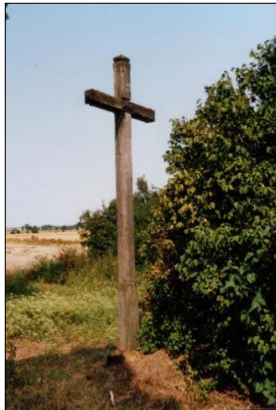
This wooden cross and a few broken headstones are the only reminders that for several centuries German-speaking people lived in Potrzymowo