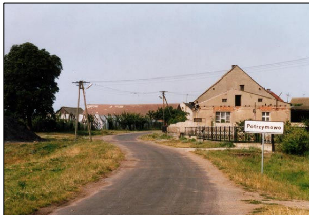
The village of Potrzymowo in 1990