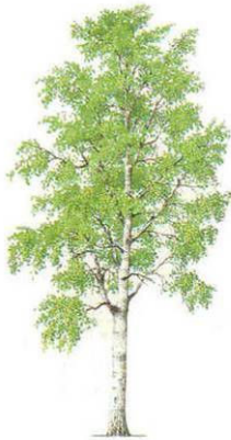
The Silver Birch - symbol of the Briese family

The surname "Briese" is of German origin and we know from 19th century emigration records that most Brieses came from the old Prussian provinces of Brandenburg, Pomerania, East and West Prussia, Posen and Silesia. In modern times, these areas are part of eastern Germany and northern and western Poland. Most people, at one time or another, wonder about the meaning of their name, part of an innate curiosity about where we come from and who we are. Can this tell us something more about our ancestors? In the case of the Briese name, there is a short answer and a long answer to this question.