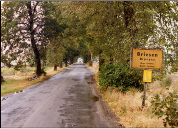
The small village of Briesen (Brjazyna in Wendish) in the Spreewald of the old East Germany

ourselves back to the 12th or 13th century, where a group of new German colonists, had settled in an area where groves of silver birch abound. They would most likely have asked the local Slavs what the place was called. "Breza" would have been the reply. As happened with Australian place names of aboriginal origin, the Germans would have picked up on the sounds and phoneticised the name to their own spelling - "Briese". Place names including variants of this term appeared throughout the eastern regions colonised by Germans (see map above for locations) and reflect the eastward movement of German-speaking people and their interaction with local Slavs 4 . Over centuries the different Slavonic languages evolved and the word for birch changed (see figure below). In areas that are now part of Poland or the Czech Republic, these names have reverted to their more modern Slavonic variants (e.g. The villages of Briesen in Pomerania and Silesia are now Brzezno and Brzezinka).