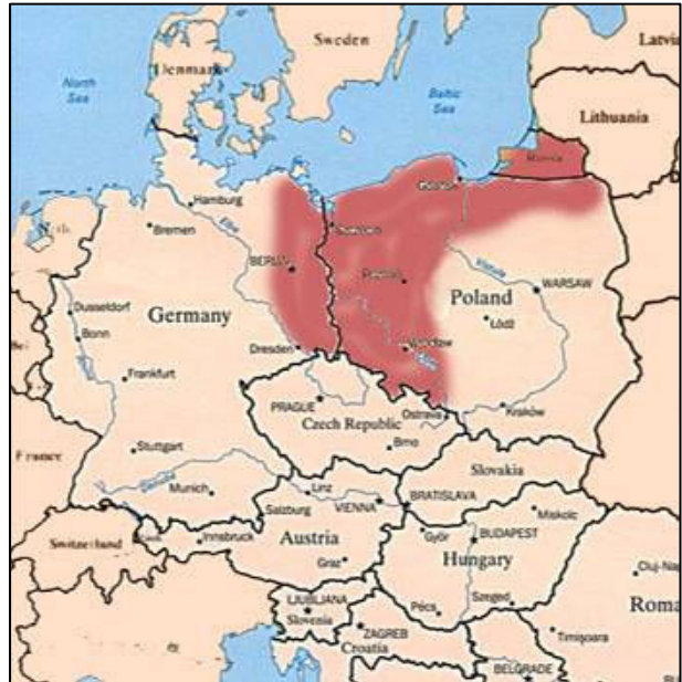
Area of origin of people named Briese (superimposed on modern European boundaries)

Looking up the meaning of German names 1 , we find that Briese is an "Ortsname" (a place name) of Slavic-German origin. Prior to the 13th century few people in northern Europe had family names and when people began to adopt such names in the middle ages, some folk (our ancestors included) living in a place called Briese took that on as their family name to identify themselves as coming from that place. This means that people taking on the surname were related by location, but not necessarily by blood. Hence, not all Brieses will be related, for example no connection has been found between the five different Briese families that have emigrated to Australia at different times, but more of that in another section.