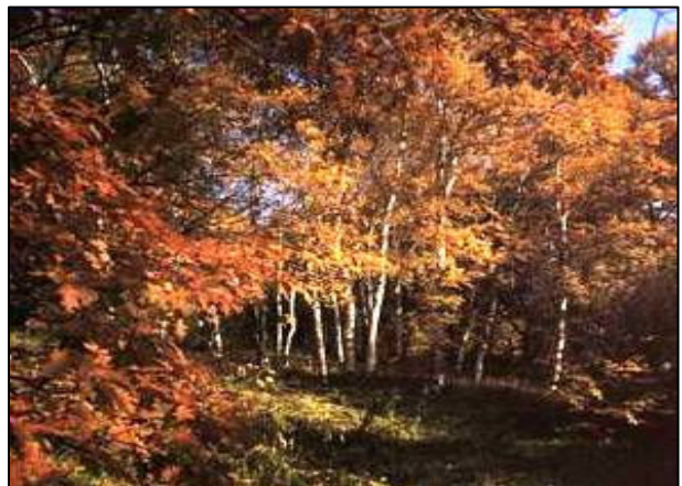
Grove of silver birch in autumn

Biogeography: As indicated above, people bearing the name Briese originate from the eastern part of the North German Plain, a lowland region extending from the North Sea to the Baltic Sea southward to the uplands of central Germany. You may have noticed that the logo used on this website is a silver birch tree.