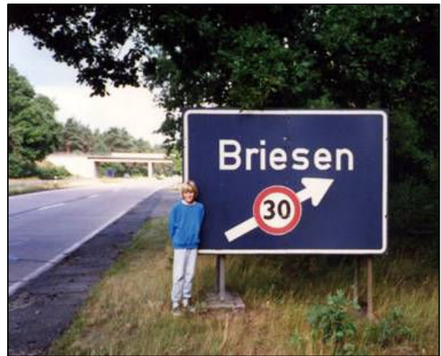
Autoroute turn-off to Briesen in the old East Germany

While the early parts of this expansion were largely through military conquest, the main period of migration from 1150 to 1400 was mostly peaceful, encouraged by both German rulers and Polish princes, who were keen to adopt German technology and the greater freedom of German political systems. The Slav princes welcomed German entrepreneurs and farmers to develop the vast underpopulated expanses of the eastern part of the North German Plain and the Germans founded many